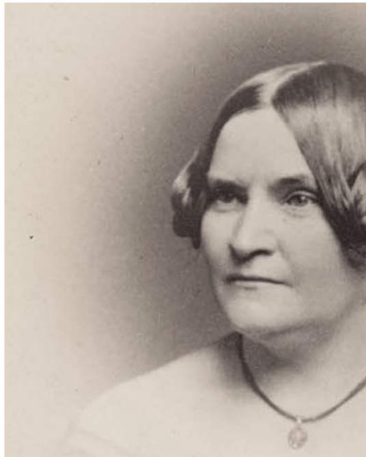
Lydia Maria Child (1802-1880) Portrait

A carillon is a musical instrument of bells. Typically housed in a purpose-built bell tower or belfry, a carillon consists of at least 23 harmonically-tuned bells operated by an intricate system of internal clappers or external hammers. Much like an organist, a carillonist can create chords, harmonies, and melodies on their instrument – sending elegant tunes wafting across the rooftops.