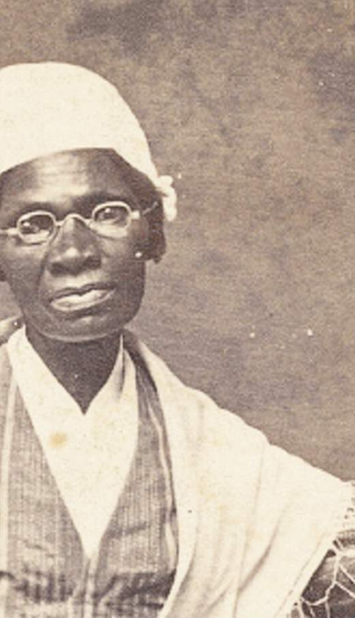
Sojourner Truth (c. 1797-1883) Portrait